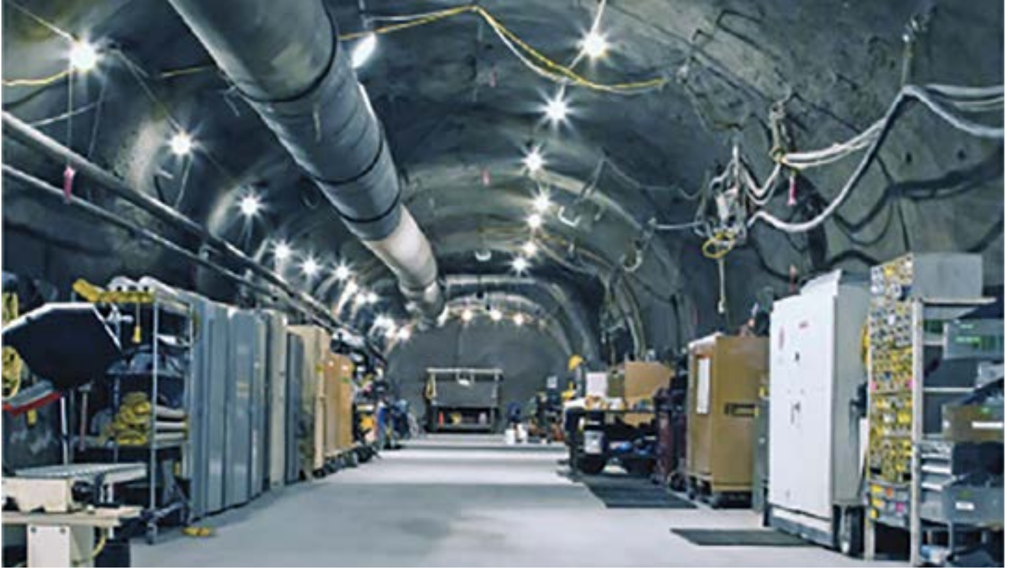
Comprising nearly a mile and a half of underground tunnels and alcoves, the U1a facility is a state-of-the-art laboratory dedicated to subcritical experiments and other physics experiments in support of science-based stockpile stewardship.